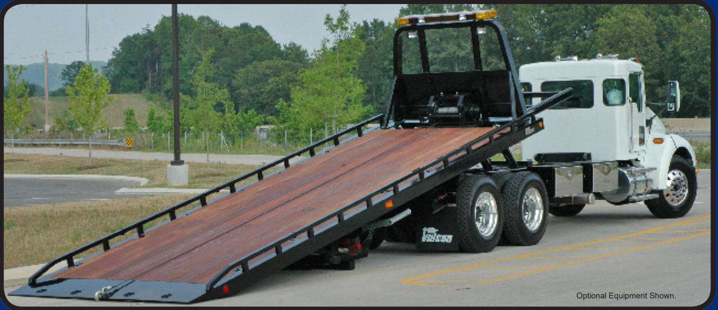
Optional Equipment Shown.